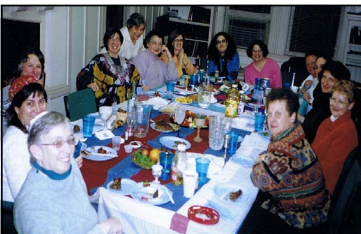
The Queens of Matzoh